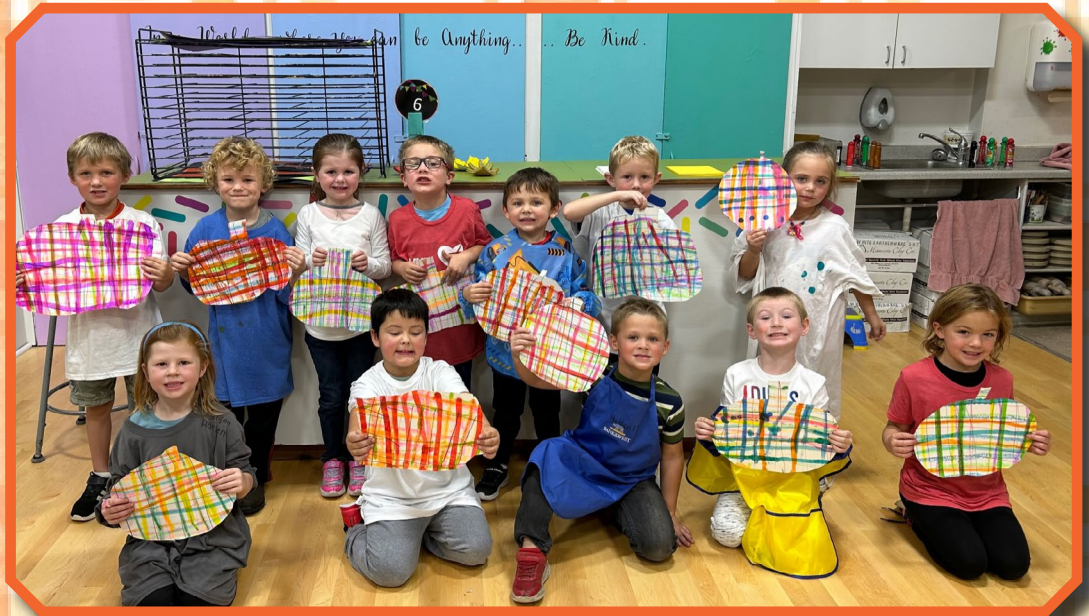
Kindergarteners and their plaid pumpkins!