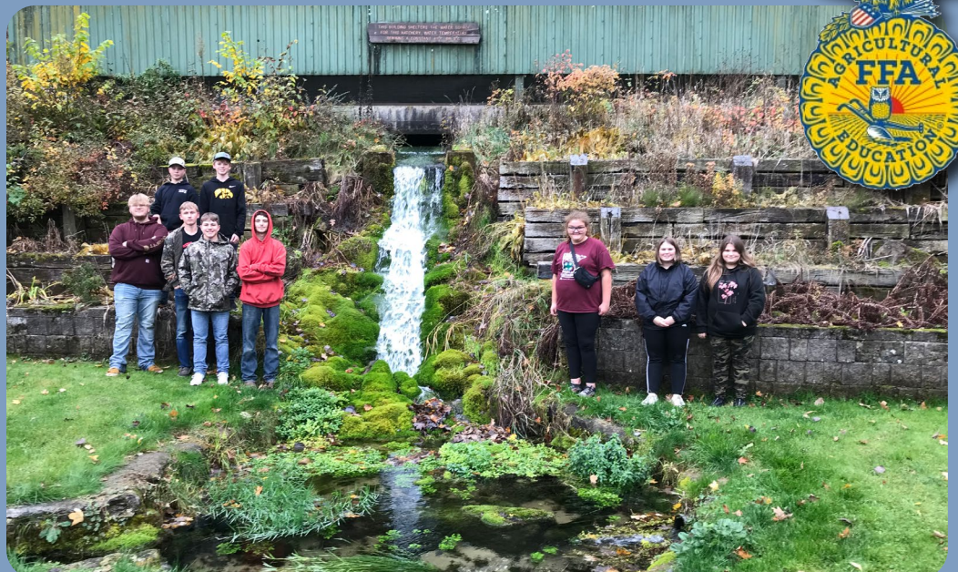
FFA members who participated in the Fish & Wildlife contest in Lanesboro, at the Fish Hatchery in Lanesboro.